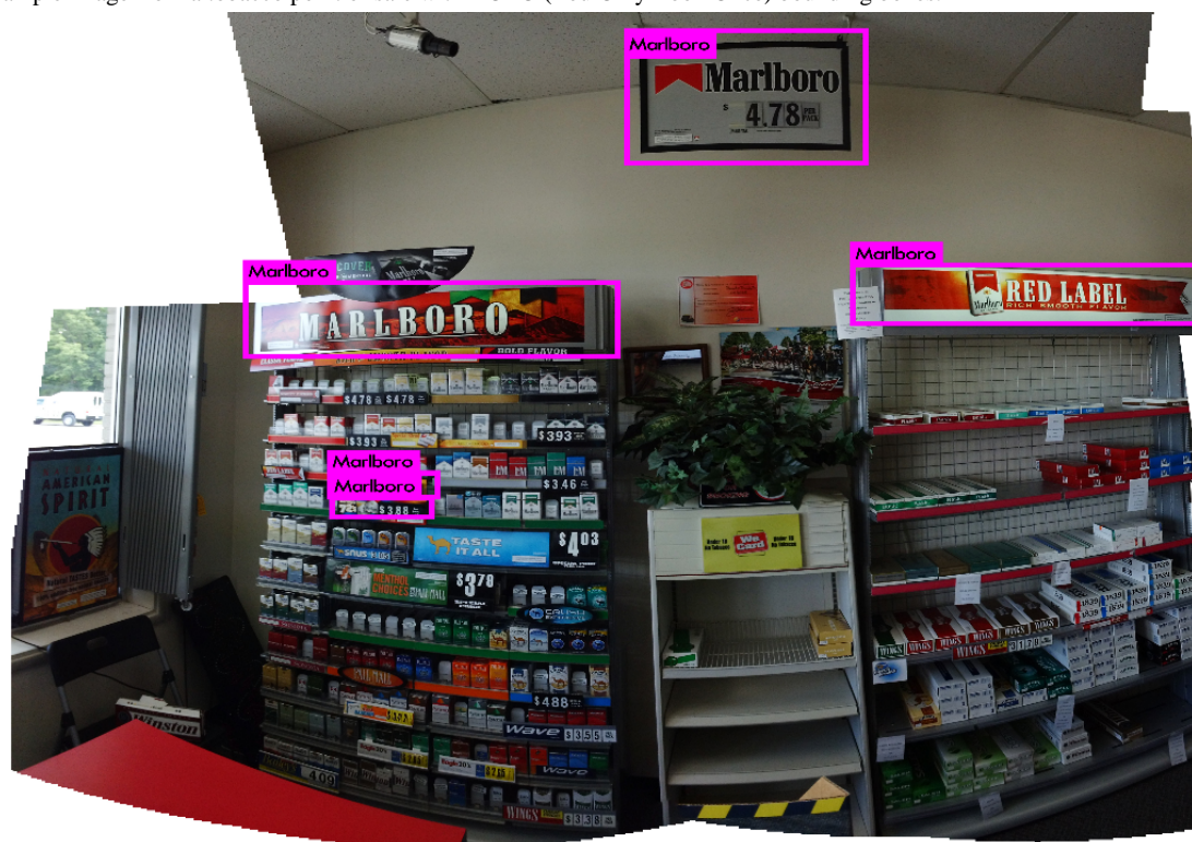
Figure 1. Example image from a tobacco point of sale with YOLO (You Only Look Once) bounding boxes.

As part of our process, we first used the open-source Visual Object Tagging Tool to draw bounding boxes around each Marlboro advertisement within images and generate related annotations for training [25]. We then trained YOLO V3 using a pretrained, publicly available Darknet-53 model on ImageNet to perform customized object detection [24,26]. Anchor boxes, predefined boxes to improve speed and efficiency in detection of typical objects of interest, were recomputed using K-means clustering with intersection over union (IOU) as the distance measure. We stopped training at the 10,000th batch, where the training loss levels off. To reduce overfitting and generalization error, we tested the network using weights from alternative stopping points generated earlier via the testing data set.